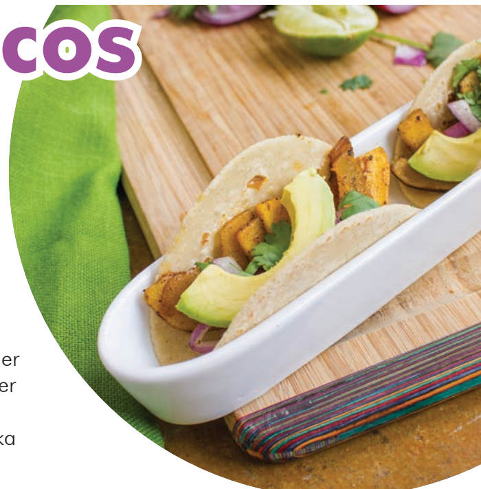
By Ellie Christensen, Outreach Assistant

½ teaspoon cayenne powder ½ teaspoon chipotle powder ½ teaspoon curry powder ½ teaspoon smoked paprika ½ teaspoon pepper 1 teaspoon salt